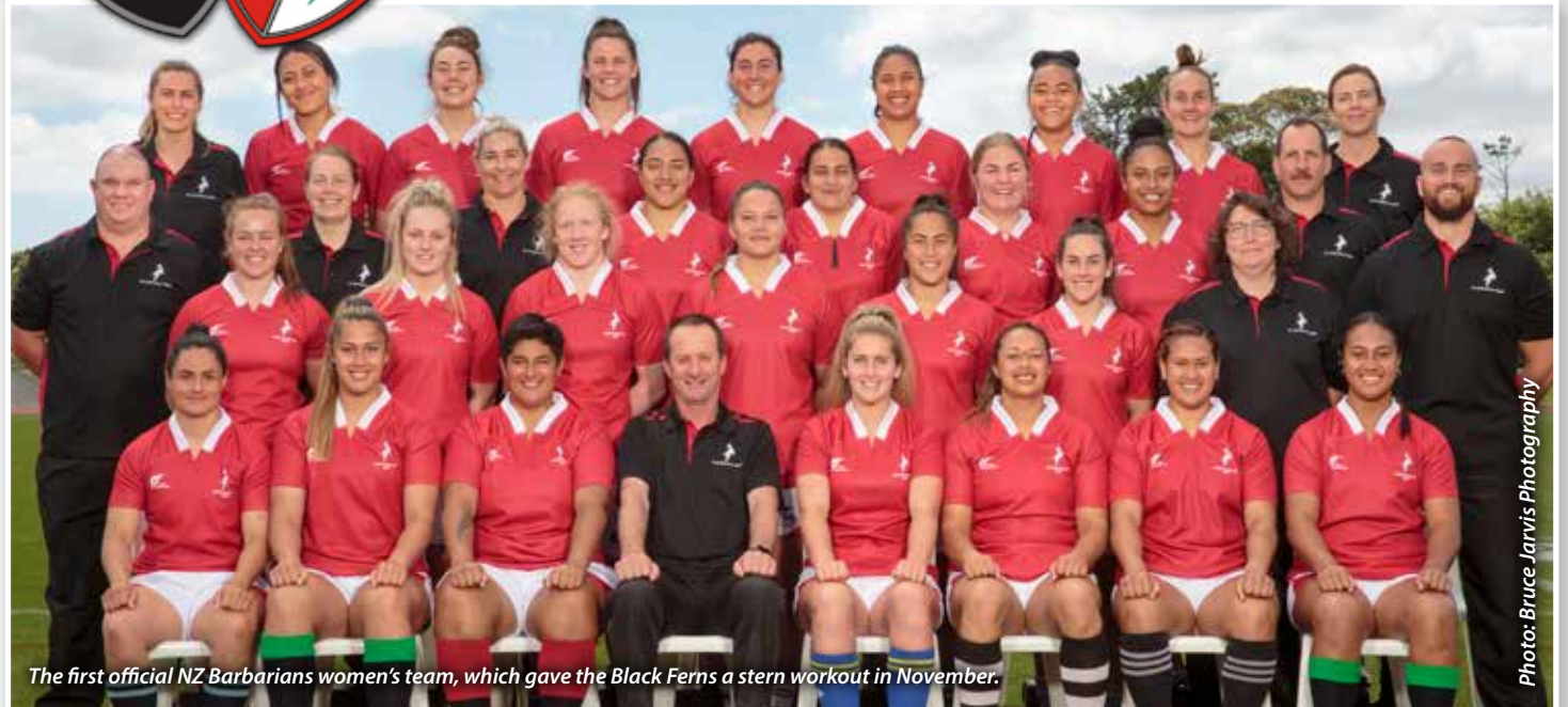
The first official NZ Barbarians women's team, which gave the Black Ferns a stern workout in November.