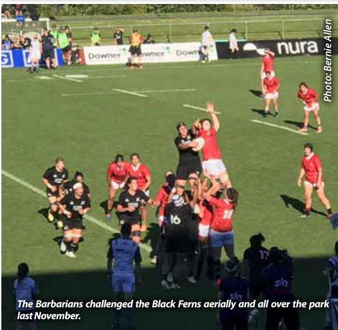
The Barbarians challenged the Black Ferns aerially and all over the park last November.