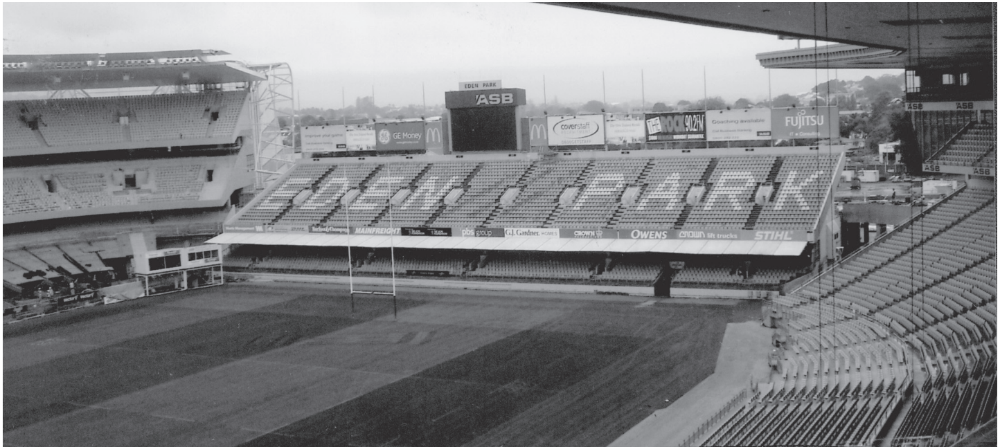
The view of part of the playing field from the front seats of the Barbarians' ASB bank boxes.