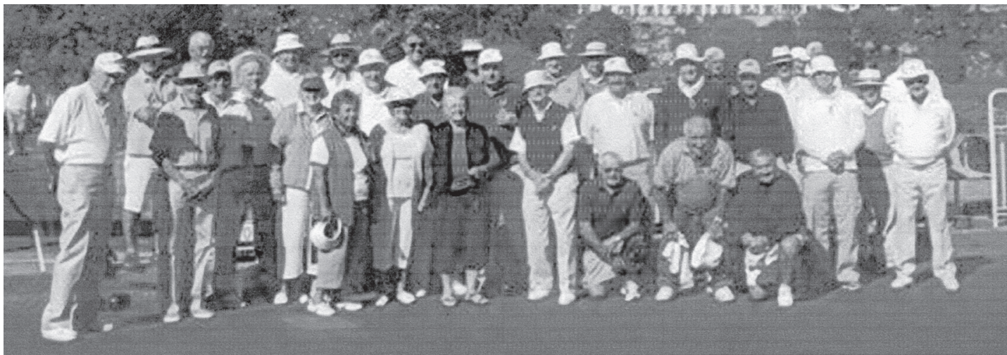
Eagles and Barbarians at the annual bowls tournament at the Mt Eden club where the play was fun, and the lunch the best meal in town.

through the era of true amateurism, which when achieved was the result of enthusiasm, plus individual effort.