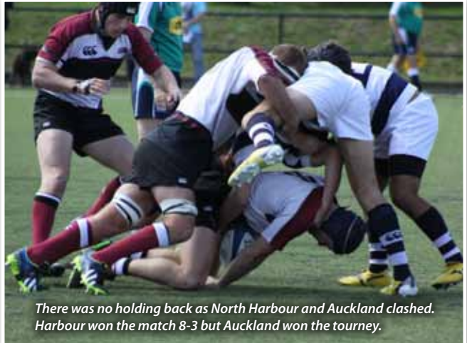
There was no holding back as North Harbour and Auckland clashed. Harbour won the match 8-3 but Auckland won the tourney.