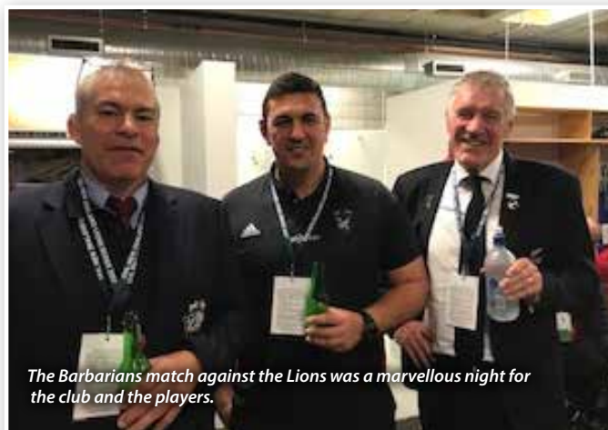
The Barbarians match against the Lions was a marvellous night for the club and the players.

Check out the full match report by Campbell Burnes here: http://www.barbarianrugby.co.nz/national.html