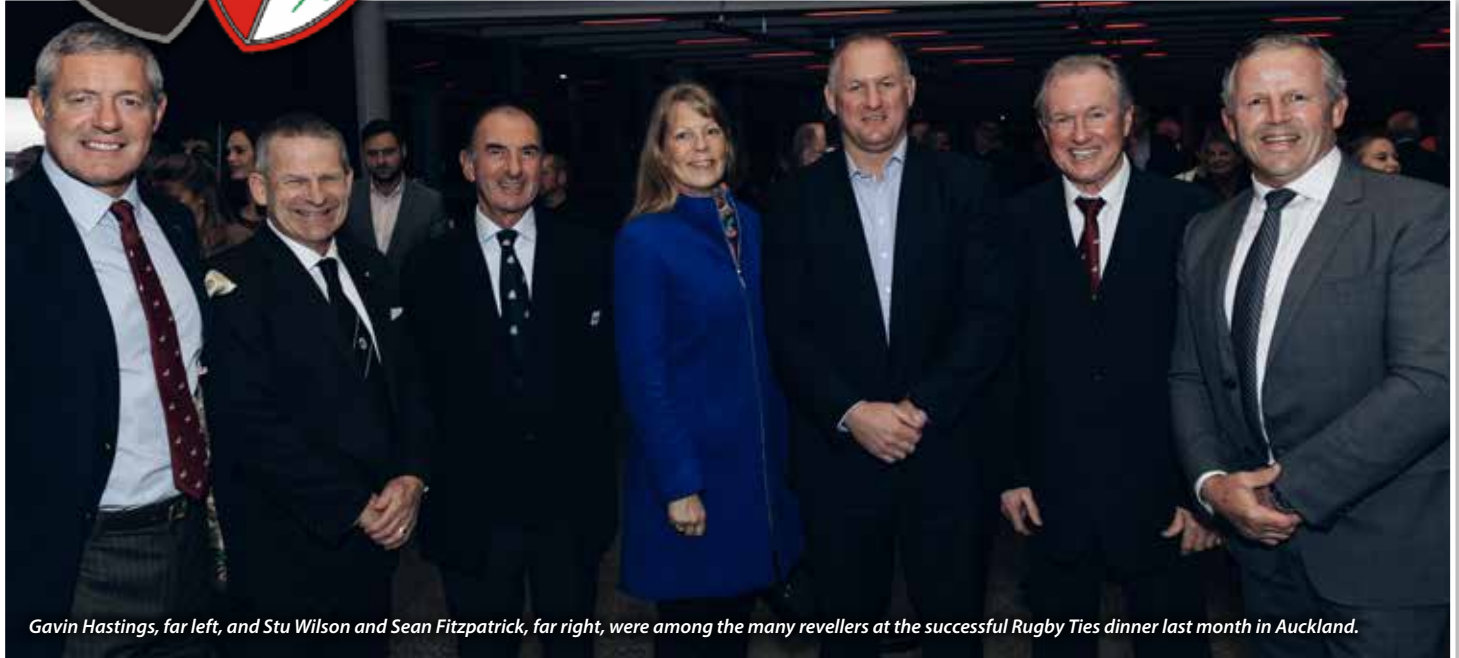
Gavin Hastings, far left, and Stu Wilson and Sean Fitzpatrick, far right, were among the many revellers at the successful Rugby Ties dinner last month in Auckland.

The newsletter of The Barbarian Rugby Football Club Inc. Level 6, ASB Stand, Eden Park, Auckland, New Zealand. www.barbarianrugby.co.nz