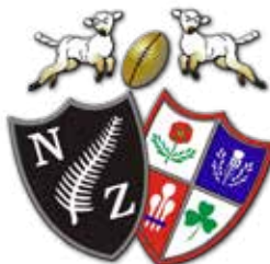
Rick Johnston President NZ Barbarian Rugby Club

Next month we'll have the NZ Barbarians Area Schools back in action. The Barbarians Under 18 boys will be flying the flag, followed in early October by the Barbarians Under 18 girls. The September 6 All Blacks-Boks Test will be huge, the biggest game of the year, the ABs putting their 50-match unbeaten Eden Park streak on the line, followed by the Bledisloe Cup clash on September 27. We just remind members to please come along and use your clubrooms. Catch you there.