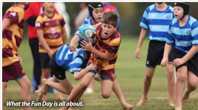
What the Fun Day is all about.

*The 2025 subs notices were sent out several months ago. Please pay your subs, if applicable, at your earliest convenience, as this is a requirement of membership.