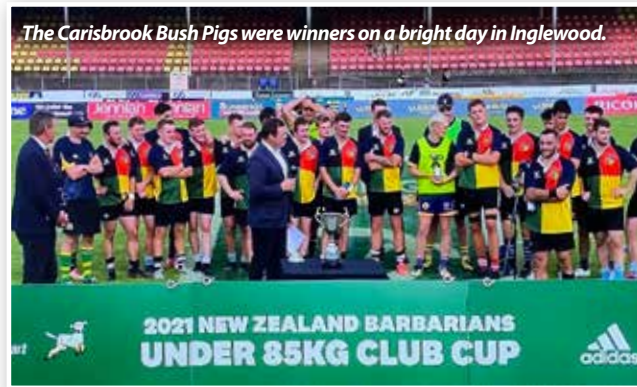
The Carisbrook Bush Pigs were winners on a bright day in Inglewood.

After the highlights of 2020, the Auckland region teams were shut out from going deep into the 2021 competition due to the regional restrictions. It all came down to the November 20 final between the Tukapa Bantams and the Carisbrook Bush Pigs in Inglewood, played as the curtainraiser to the Taranaki v Otago NPC Championship final.