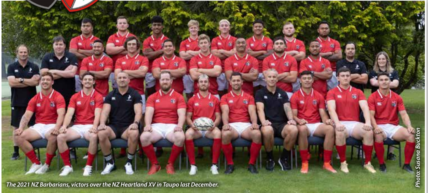
The 2021 NZ Barbarians, victors over the NZ Heartland XV in Taupo last December.

www.barbarianrugby.co.nz • FB: @NZBarbarianRugby • Insta: @nzbarbarianrugby