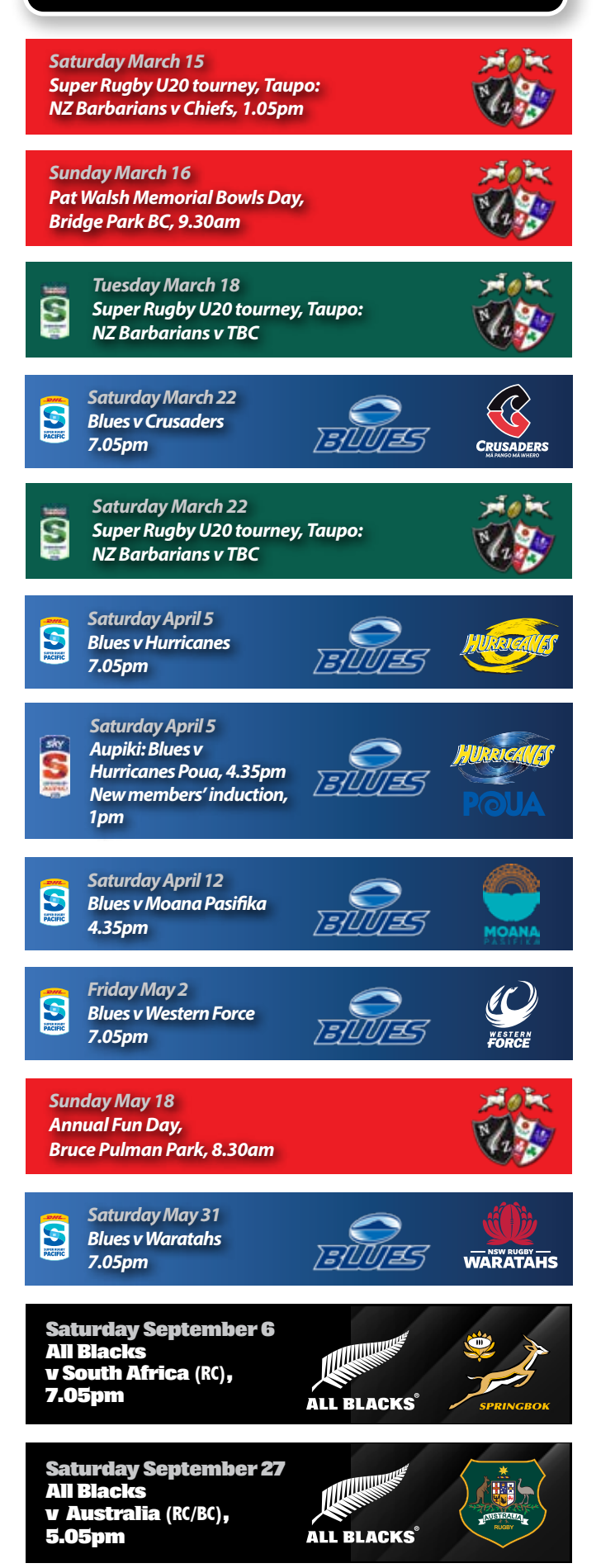
*All events are at Eden Park unless otherwise specified.

*Keep an eye on the website and your email for confirmation of further 2025 functions/events.